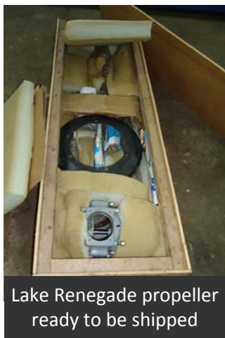
Lake Renegade propeller ready to be shipped